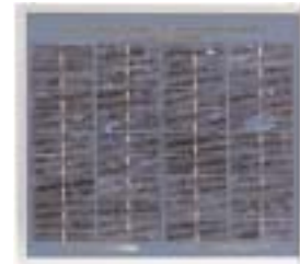
BP SX 5 scale 1:9

The BP SX 5 is a 5W module that uses standard polycrystalline cells and charges batteries efficiently in any climate. It is the smallest BP Solar module available and has been especially designed for use in off grid applications such as telecommunications, telemetry, instrumentation systems and signals. BP Solar's SX range of solar modules offer cost effective power for small or moderate energy requirements, with a wide range of module power and size options available for stand alone installations.